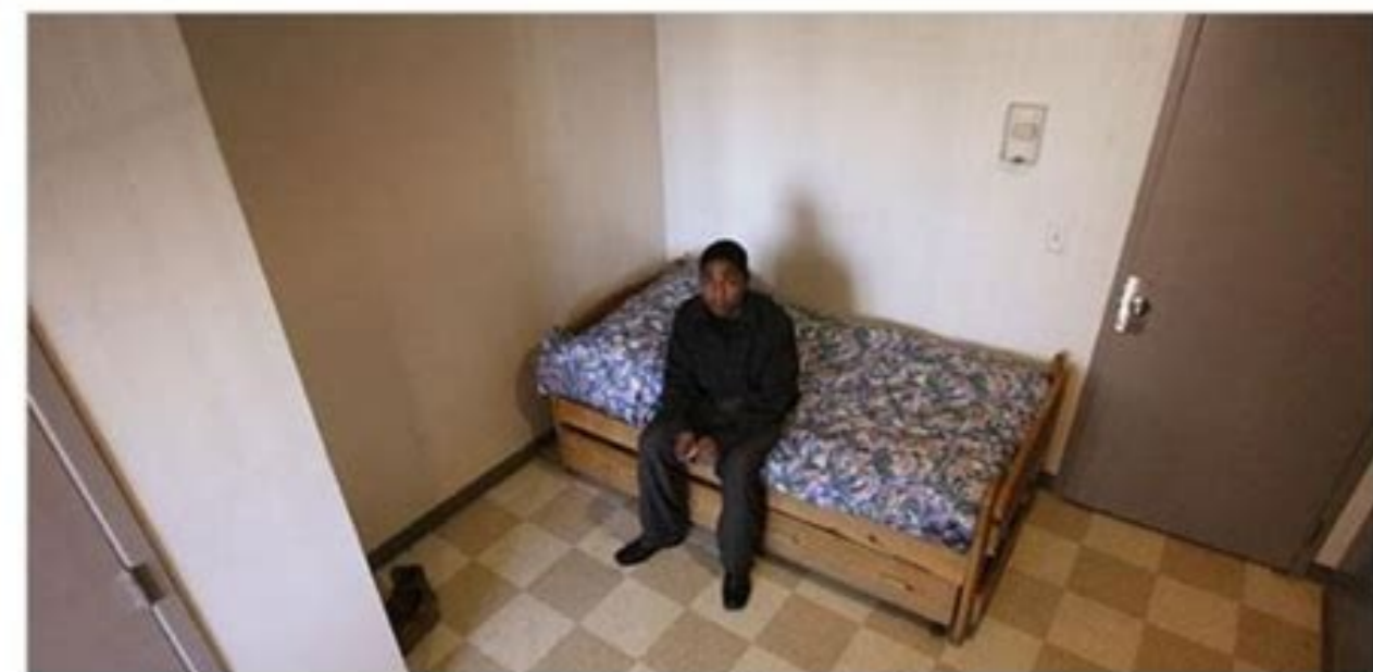
Fig. 2. A room in the crisis center of Covenant House in Detroit. Photograph by Amy E. Voigt, from "Offering Help for Former Foster Care Youths," by Erik Eckholm ( New York Times ; New York Times , 27 Jan. 2007; Web: 11 Aug. 2010).

If you do not use original content, a source citation must be included. Include all source information with the figure; if you do not use the source elsewhere in the text, you do not need to cite the source on the Works Cited page. See example below.